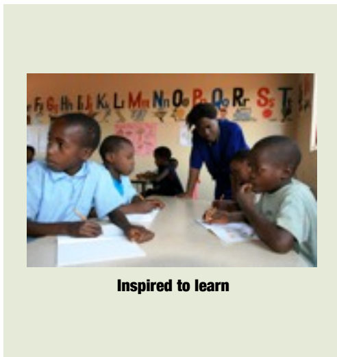
Inspired to learn

Wishing everyone a happy and safe holiday! See you in the New Year